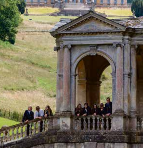
to study at the open morning on Saturday 24 September, from 9:30am. Register at priorparkcollege.com

Prior Park is a school where creativity is valued. It looks to challenge students to be the best, and truest, versions of themselves, and the school provides this challenge in a caring and supportive way. Students emerge with a character that's well rounded, and an academic profile that allows them to make their next step in life with confidence — whatever that step might be. It's a school where your family will find a warm welcome and where your children will grow into Prior Park capable, confident and compassionate adults.