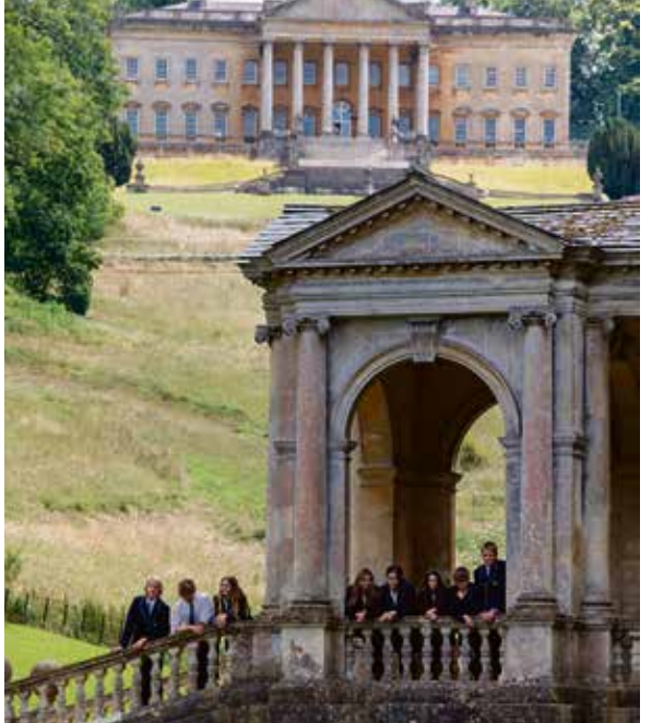
Discover what makes Prior Park College such a special place

Support your child's assessment journey. Visit ISEB's Families Hub and register to receive free exam practice, revision and preparation advice and materials. iseb.co.uk/families-hub