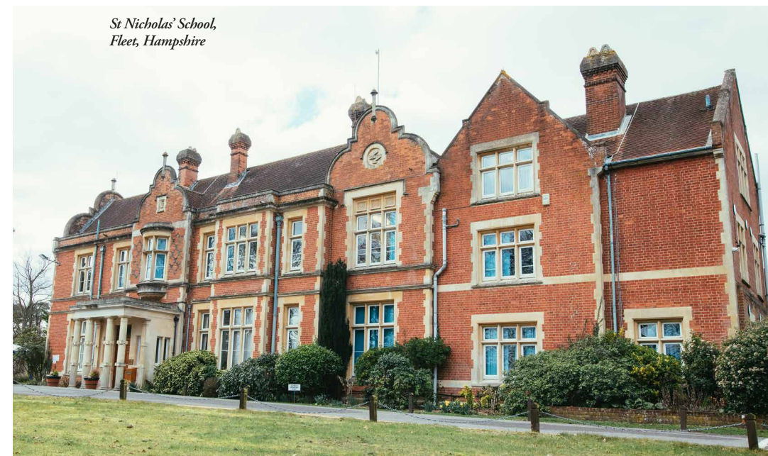
St Nicholas' School, Fleet, Hampshire

Bound by a shared passion for education and innovation, it's clear that together ISEB and Century Tech will leave a lasting impact on the education industry. Ambitious, certainly – but this is a partnership that promises real change.